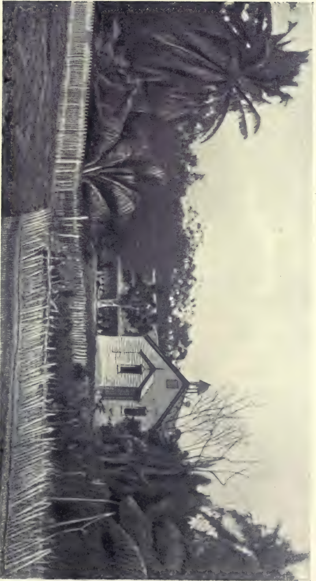
THE CHURCH ON ANIWA